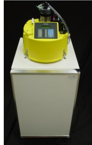
YB Multi-bottle Sampler on 6.1 cu. ft. White