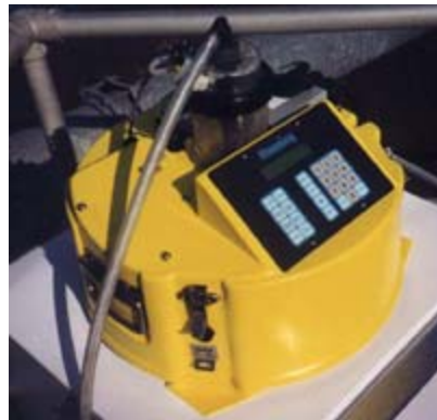
VSR Sampler Control Panel