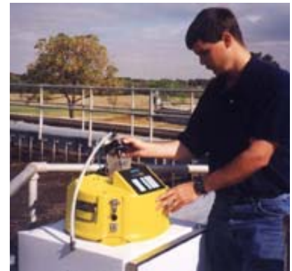
VSR Sampler Operation