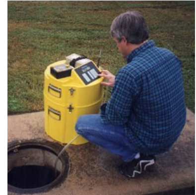
The PST Is Suitable for Use in Manholes