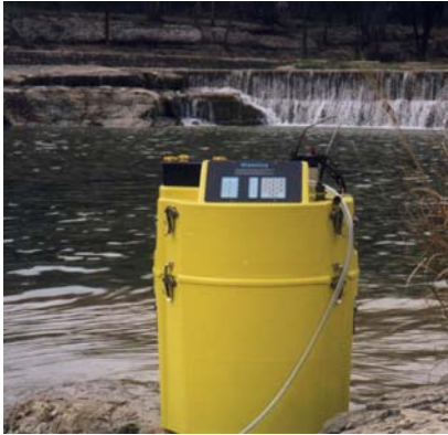
Manning Environmental Model PST